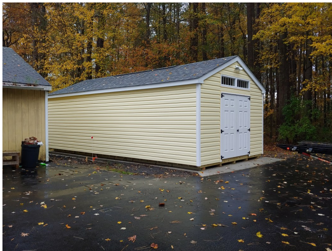
New Council shed is now in service.

Council Dues were mailed, if you did not receive your notice please contact the Financial Secretary